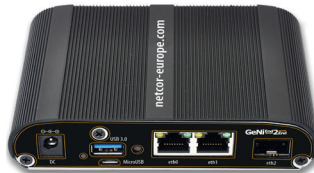
GeNiJack 201 with two RJ45 ports and one SFP port