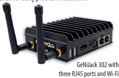
GeNiJack 302 with three RJ45 ports and Wi-Fi

GeNiJack 201, GeNiJack 302 and GeNiJack 401 are new integrated GeNiEnd2End Hardware Endpoints for NETCOR's GeNiEnd2End 24/7 end-to-end service monitoring software. It is very easy to deploy the GeNiJacks into the network to deliver End-to-End active performance monitoring and analysis of Triple Play network traffic. Under the control of the web based GeNiEnd2End network management and reporting solution the GeNiJacks monitor permanently the QoS and QoE performance metrics of Triple Play applications. In case predefined thresholds are exceeded, an alarm is generated for early problem detection.