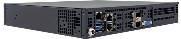
GeNiJack 401 with two RJ45 ports and two SFP ports