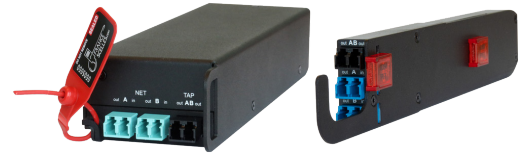
DiodeTAP Module Multi-Mode (left) and Single-Mode (right)

The DiodeTAP Module is part of the MOD-TAP series, and uses the Modular Chassis for rack mounting, providing up to 16 single-mode modules or 6 multi-mode modules in 1U.